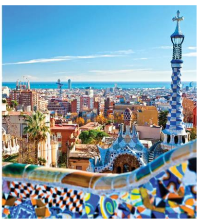
Highlights... Madrid, Royal Palace, Toledo, Cordoba, Seville, Flamenco Show, Granada, The Alhambra, Valencia, City of Arts & Sciences, Lladro-City of Porcelain, Paella Experience, Barcelona, La Sagrada Familia, Parc Guell

Day 1: Saturday, June 11, 2016 Overnight Flight